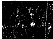
Figure 3 The down-sampled image (120 * 90).