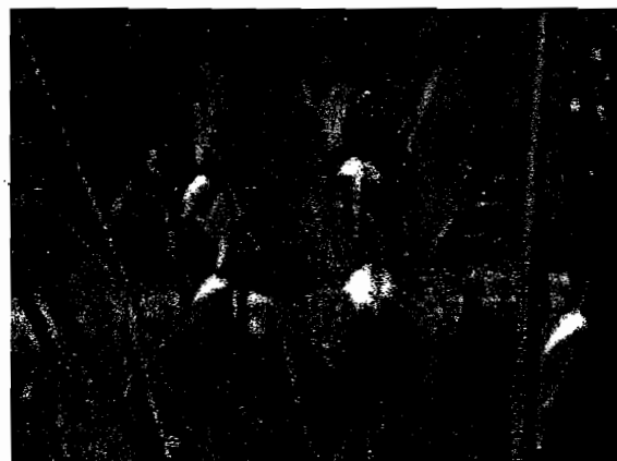
Figure 4 The up-sampled image (1600 * 1200).